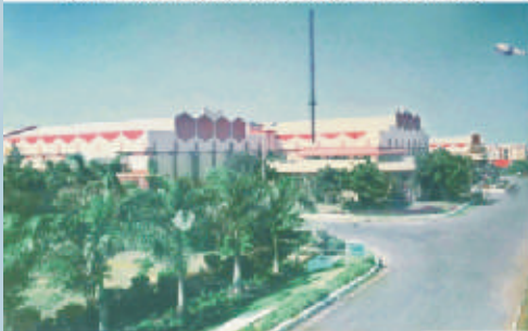
SPENTEX INDUSTRIES LTD.-PITHAMPUR