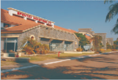
SPENTEX INDUSTRIES LTD.-BARAMATI