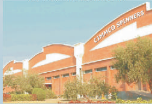
CIMMCO SPINNERS, SOLAPUR