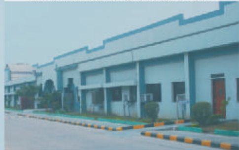
SPENTEX INDUSTRIES LTD.-BUTHORI