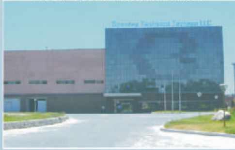
SPENTEX TASHKENT TOYTEPA LLC-TASHKENT