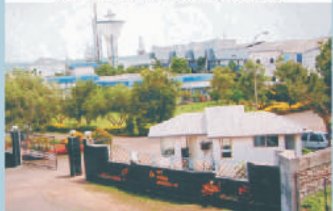
AMIT SPINNING INDUSTRIES LTD.-KOLHAPUR