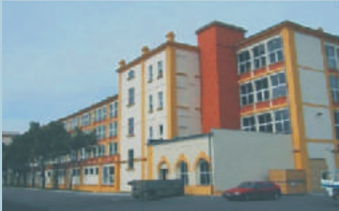
SPENTEX INDUSTRIES LTD.- CZECH REPUBLIC